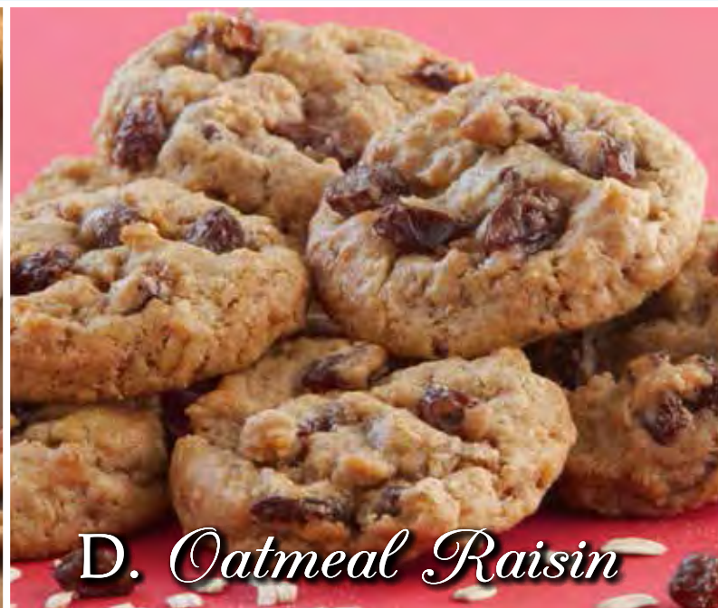
D. Oatmeal Raisin