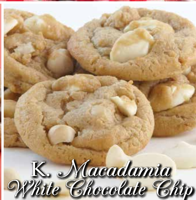
K. Macadamia White Chocolate Chip