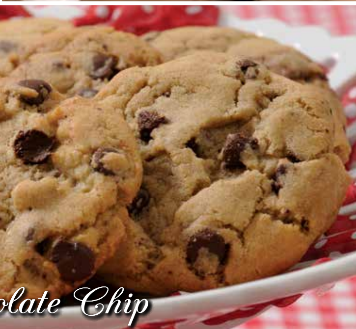
F. Chocolate Chip