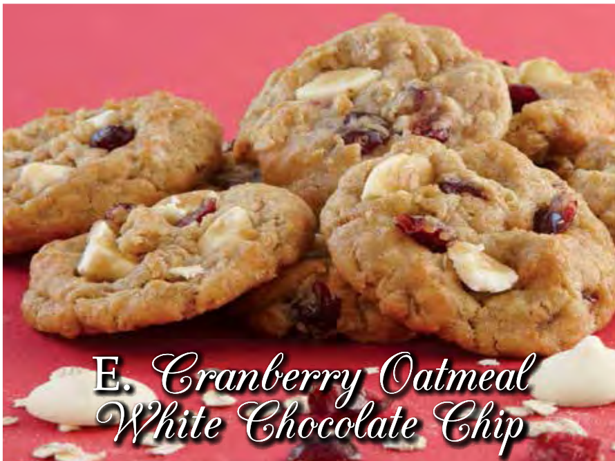
E. Cranberry Oatmeal White Chocolate Chip