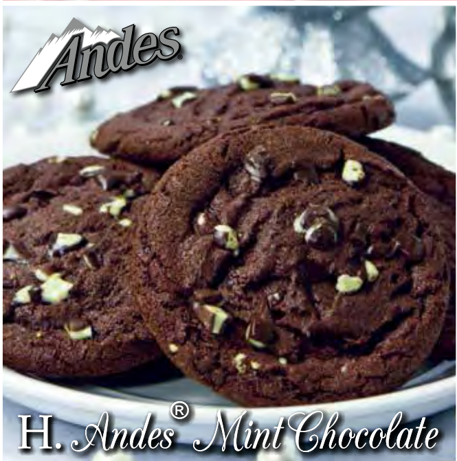
H. Andes ® Mint Chocolate