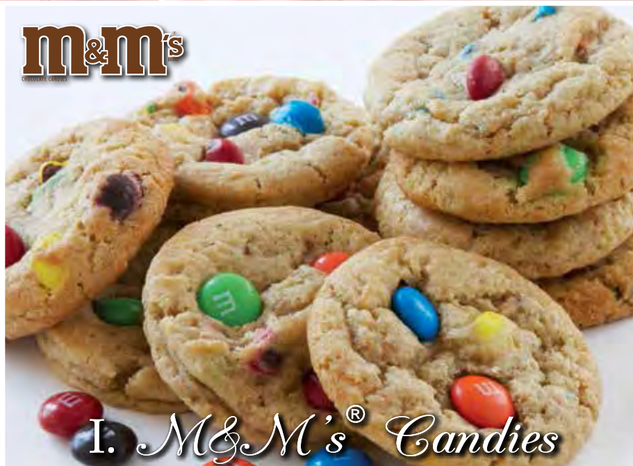
I. M&M's ® Candies