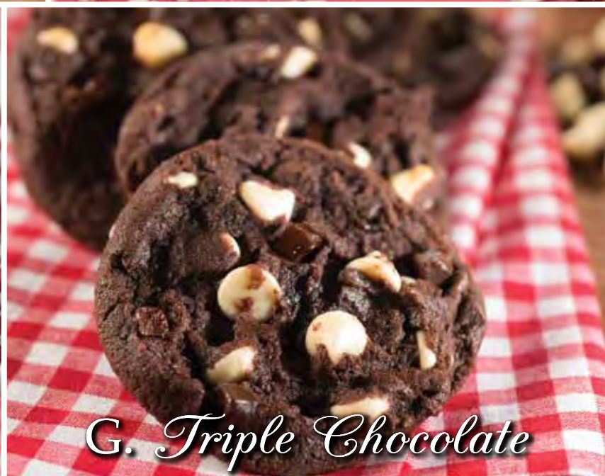
G. Triple Chocolate