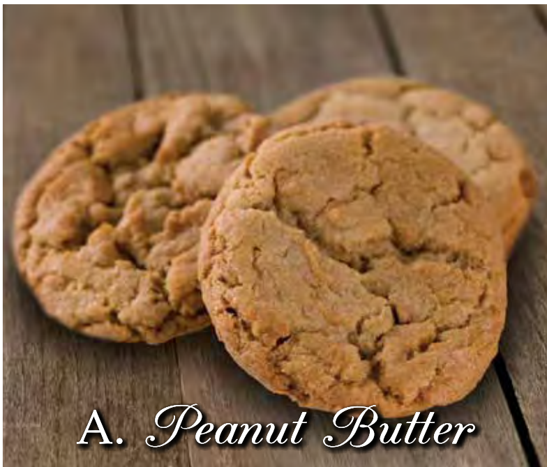
A. Peanut Butter